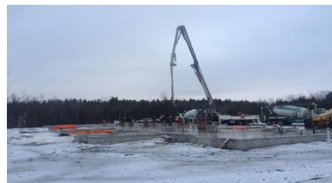
The warm January weather enabled the concrete floors to be poured.