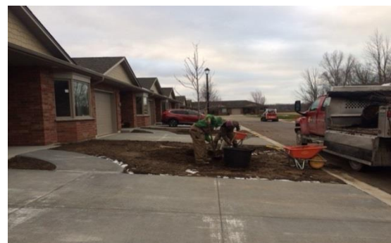
And plant trees