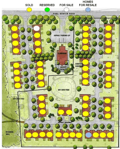
Available new build and resale

It is the last new build so Buy yours now!